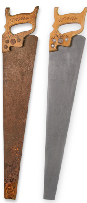
THE RUST FACTOR restored this saw and did not harm the wood